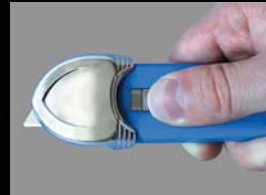
Tray Cut B Position For Medium Blade Depth