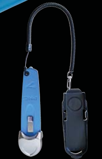
UKH-545 Safety Holster & CL-36 Coiled Lanyard Available