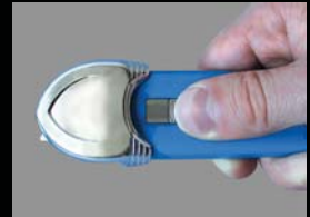
Tray Cut C Position For Minimum Blade Depth