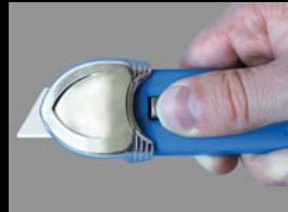
Tray Cut A Position For Maximum Blade Depth